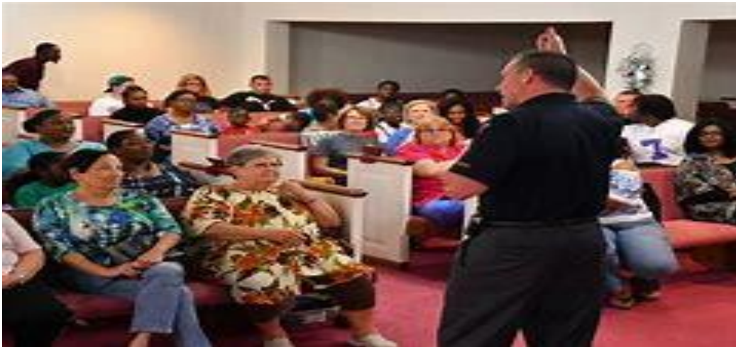
Educating the community about the Active Shooter

crime report is false or baseless and therefore “unfounded.” Only sworn or commissioned law enforcement personnel may “unfound” a crime report for purposes of reporting under this section. The recovery of stolen property, the low value of stolen property, the refusal of the victim to cooperate with the prosecution, and the failure to make an arrest do not “unfound” a crime report.